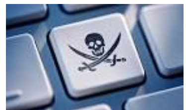
Pirating music, videos, and software can cause your PC irreparable damage.

"A study by the American Assembly at Columbia University has found that 46% of American adults would be considered copyright pirates under US law."