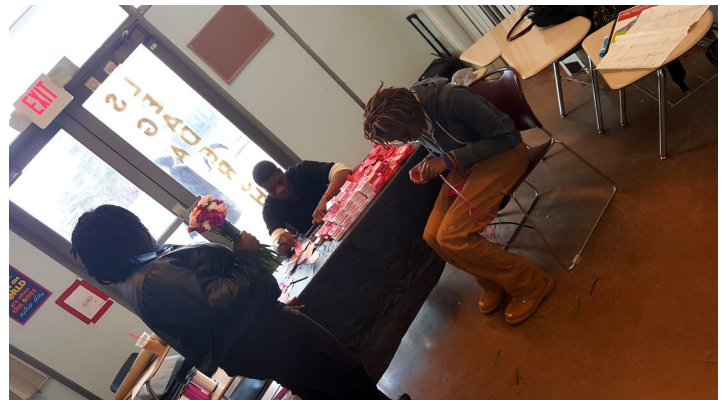
Pictured above, student leaders work hard to assemble gifts for the Valentine's Day fundraiser.