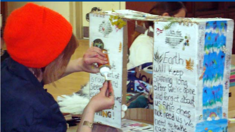
(Above and below) PCJA students expressed their own ideas about Earth Day Every Day through creative poetry, essays, songs, posters and other artwork creations. Their work was displayed prominently on campus.