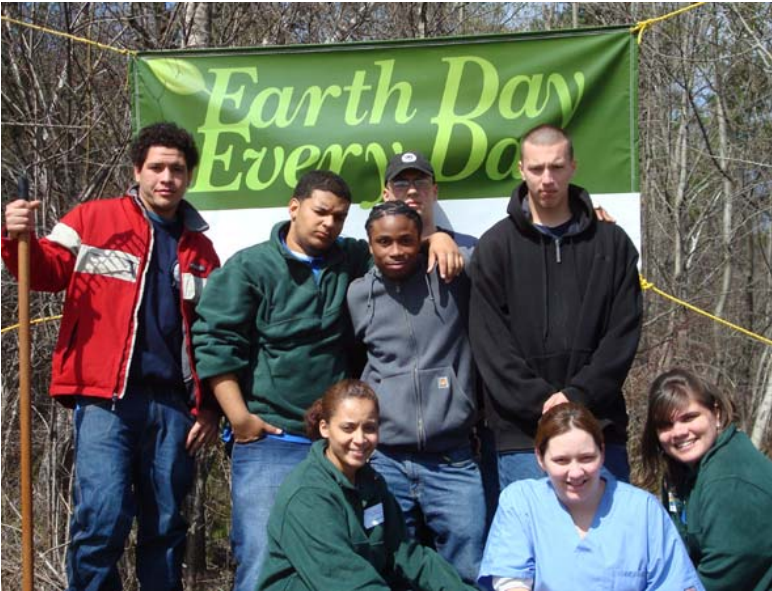
Job Corps' Earth Day Every Day campaign encourages students and staff to adopt green practices that will last a lifetime. A massive cleanup effort commemorated the 40th anniversary of Earth Day in April.