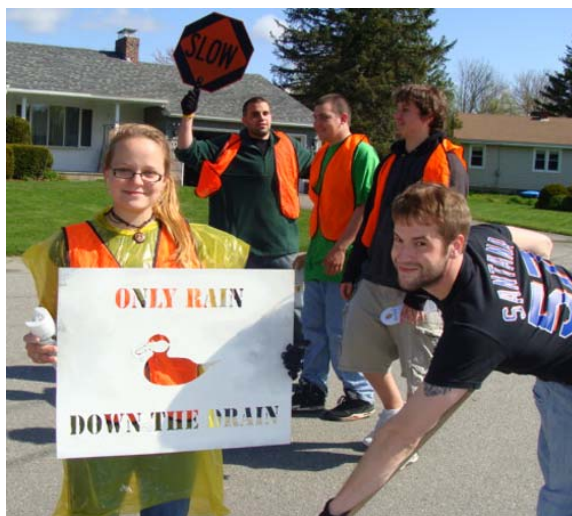
Some 30 PJCA students and staff volunteered to help the City of Brewer, Maine, clean and stencil storm drains this spring, as well as educate the public about the harmful effects of pollutants on area rivers and streams.

In addition to the storm drain project, PJCA participated in two other community service initiatives this spring — volunteering at the City of Brewer river cleanup and cleaning up after the City of Bangor’s annual Kenduskeag Stream Canoe Race. ■