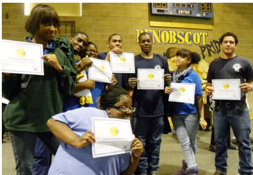
PJCA students are honored with certificates for their volunteer cleanup efforts.