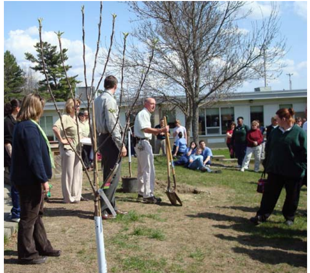
PJCA held a tree planting ceremony as part of the Earth Day Every Day campaign kickoff. One tree was planted to commemorate the event and a second was planted to celebrate the 30th anniversary of the Academy.