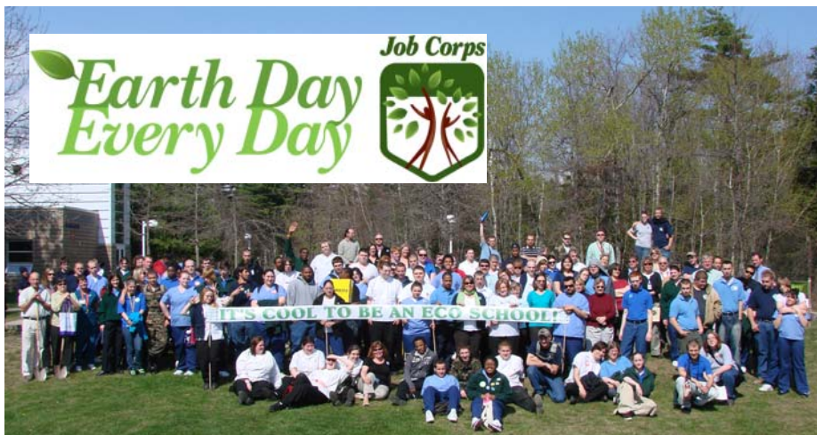
PJCA students and staff gather in unison during the Earth Day Every Day campaign kickoff to show their commitment to being stewards of the environment.