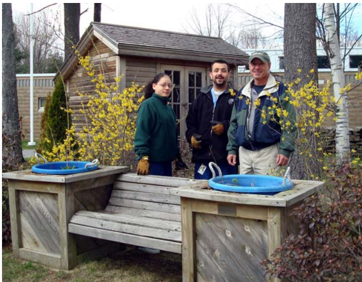
As part of a special Earth Day Every Day project this spring, PJCA students and staff worked together to refurbish various benches and trash receptacles across the campus.