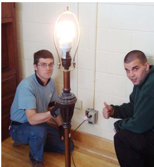
Students went around campus and conducted their own energy audits finding ways to make the Academy more energy efficient.