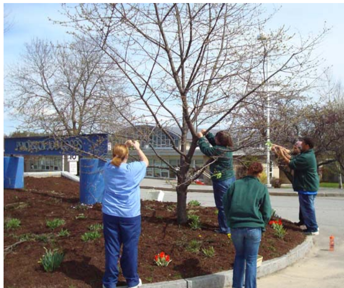
(Above and below) PJCA students hang green ribbons on the trees across campus to commemorate the Earth Day Every Day event — signifying their commitment to be “earth friendly.”