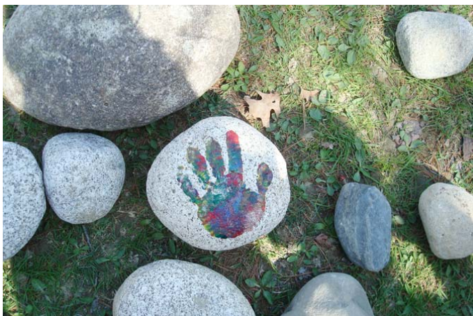
(Photo left) PJCA students were invited to create and decorate their own personal garden stones to beautify the Academy as part of the Earth Day Every Day campaign.