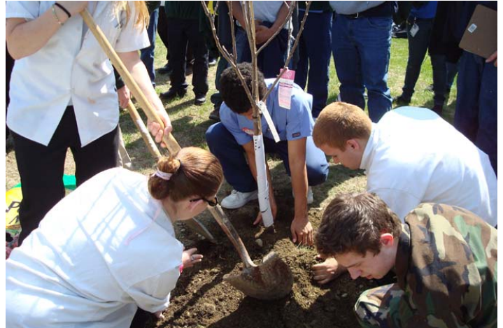
Penobscot students and staff plant trees to commemorate the 40th anniversary of Earth Day and kick off the Earth Day Every Day campaign. (Story and more photos can be found on pages 4-5.)