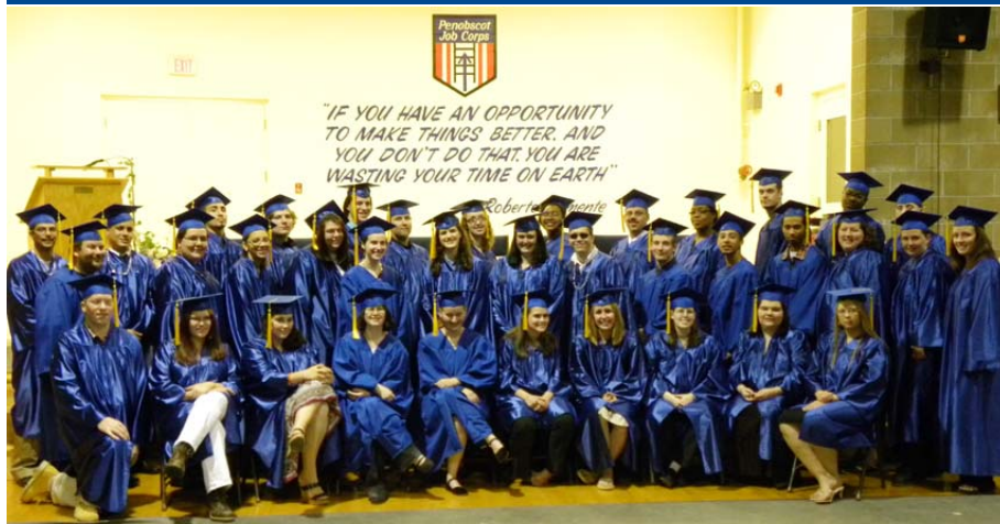
(Above) PJCA spring graduates proudly gather for a class picture. (Below) graduates and their families are all smiles at a pre-commencement breakfast.